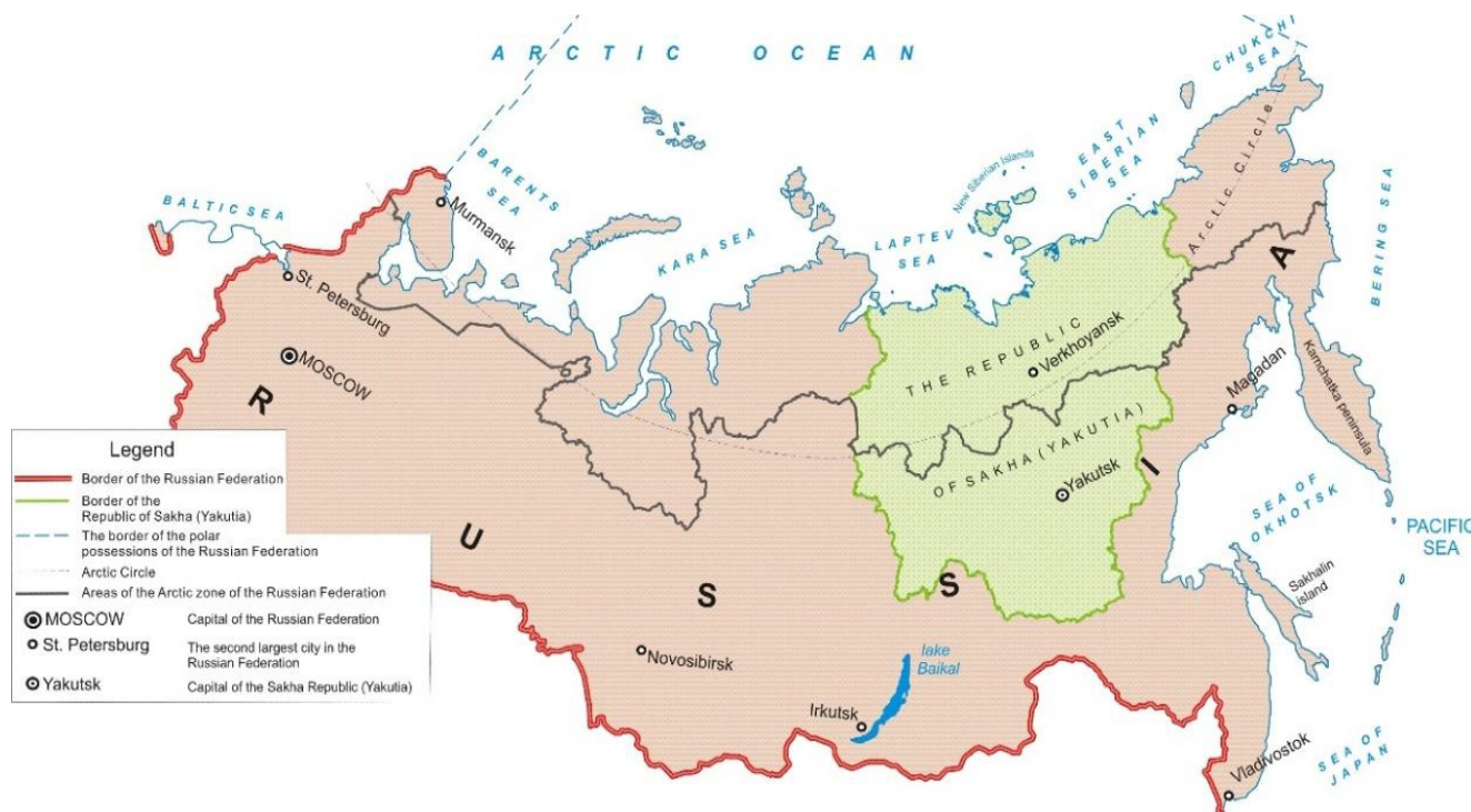
Figure 1. Location of the Sakha Republic into Russian Federation.

fishing [17]. With the arrival of the Russians, people living in the Lena Krai (Yakutia) were declared yasak subjects, i.e., paid tribute in the form of yasak (in russ.—tribute). The main part of the yasak was sable; fur became the main trade of the Russian currency, and Yakutia provided up to one-third of the goods. The fur was supplied to replenish the treasury of tsarist Russia and was also exported to Europe and China. The tightening of the yasak regime and the intensification of fur harvesting led to the predatory extermination of the resources of the fur trade, their depletion, and up to the threat of extinction of some species. The first fur-bearing animal of Yakutia, the natural reserves of which were undermined in the 17th century, was the sable. The reduction in the sable resources of the region continued during the second half of the 18th up to the mid-19th centuries. In the North and Northeast of Yakutia, it disappeared as early as the 18th century. In the 1830s, the sable began to disappear in the basin of the Vilyuy River, in the Kolyma Okrug [18]. The extermination of sables peaked in the first quarter of the 20th century. The history of the development of fur-bearing animals in Yakutia is a clear example of the predatory use of natural resources: irregular taking and the direct pursuit can lead to the extinction of certain species.